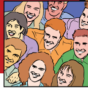
The Talking Stick is a unique method to get people talking, sharing and laughing.