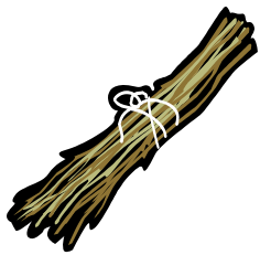
This is an example of a talking stick, but a "stick" can be of any design.

The Talking Stick is not a new idea. In fact, the Talking Stick has been used for centuries as a way to promote peaceful, fair and focused heart listening with others.